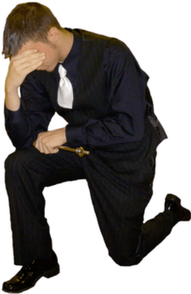
Figure 4 Marshall kneeling for prayer

The Marshall kneels as in Figure 2. If the Marshall is carrying a baton, he kneels placing the baton across his right leg, behind his right elbow.