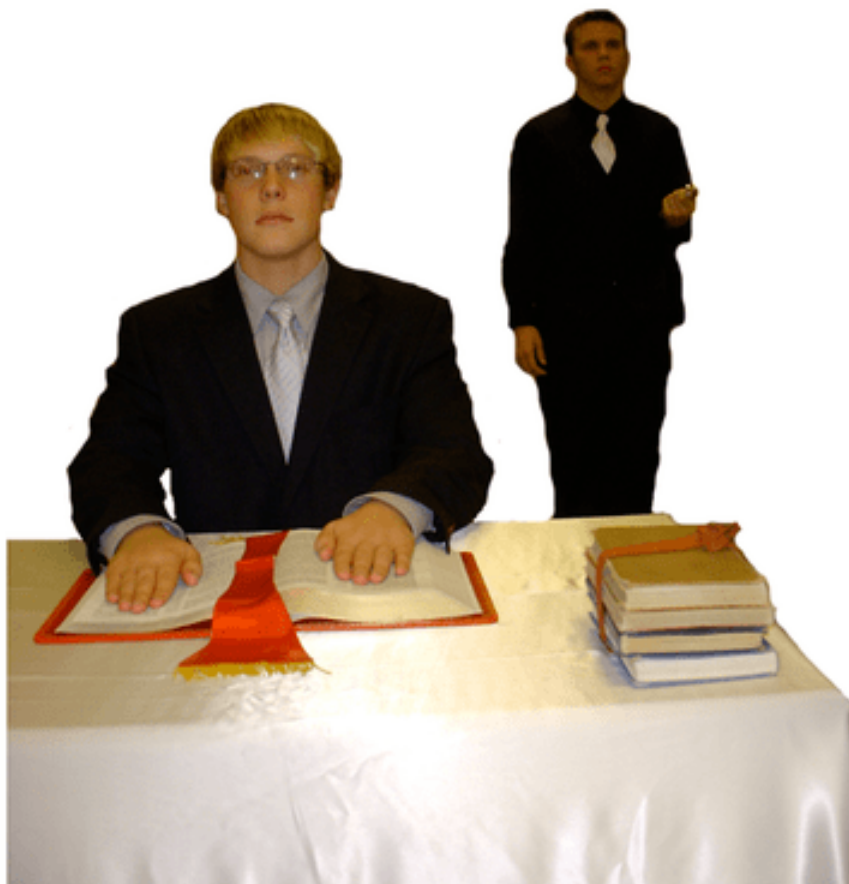
Figure 3 Chaplain kneeling at Altar

Chaplain kneels at Altar on both knees, both hands palms down on the Holy Bible, body erect, and head slightly turned up; eyes may be open or closed.