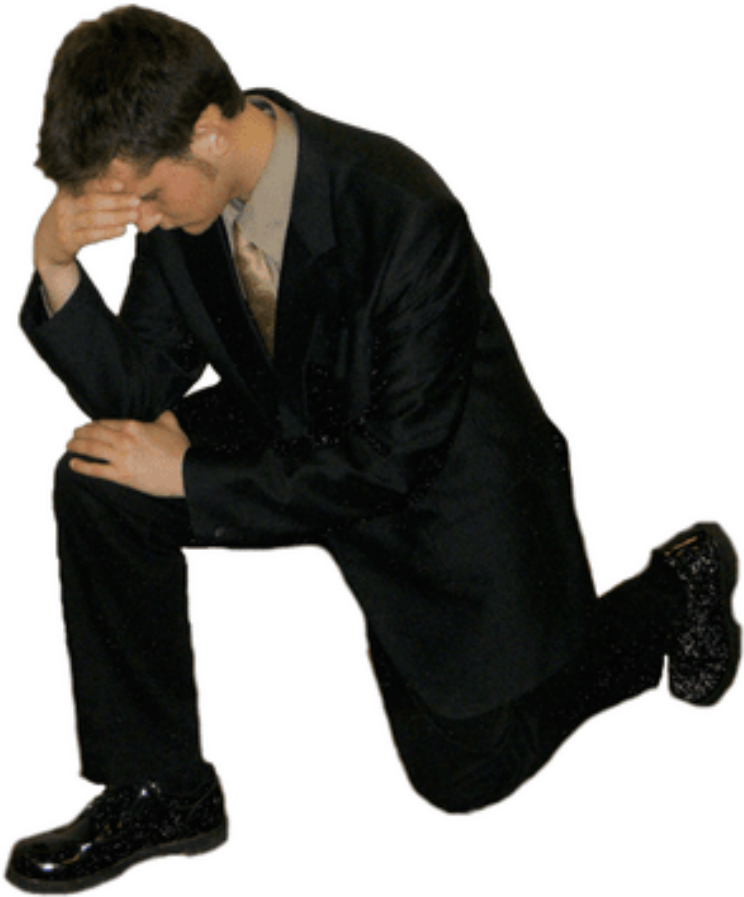
Figure 2 Kneeling for prayer

An Active DeMolay kneels on his left knee, his right elbow resting on his right knee, his forehead resting in his right hand, his left hand around his right elbow.